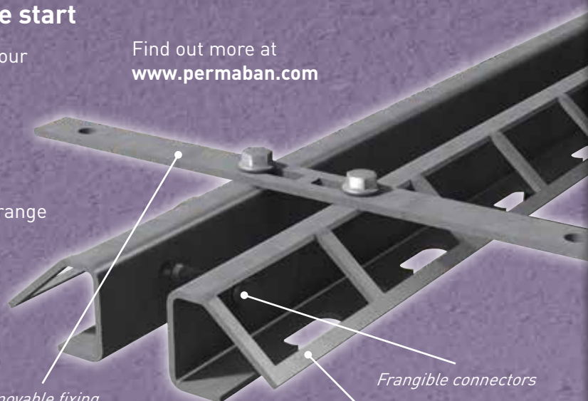
Removable fixing brackets (supplied)