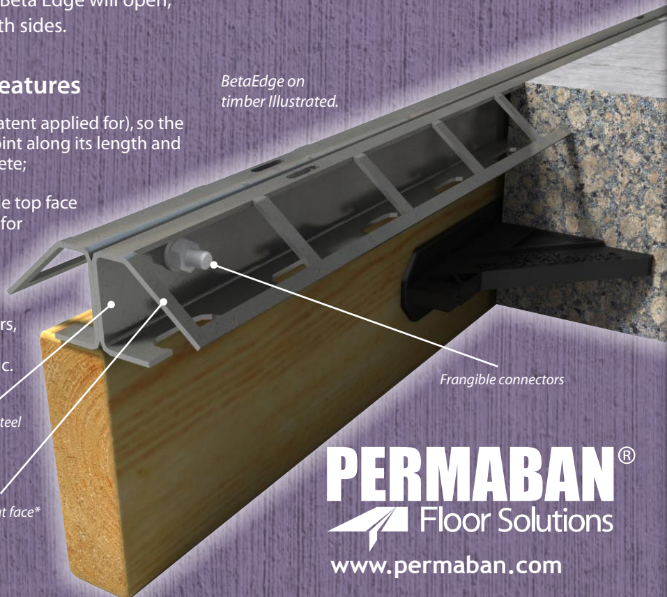
BetaEdge on timber Illustrated.

PERMABAN ® Floor Solutions www.permaban.com